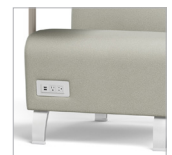
Power Port (specify seated L or R)

*See Price List for available options and restrictions.