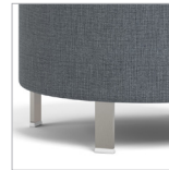
Bar Leg (coordinates with Sled Base)