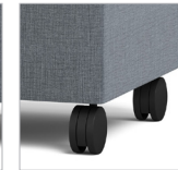
5" Heavy Duty Caster