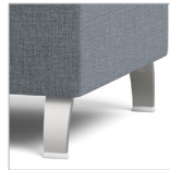
Brushed Aluminum Leg