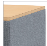
Laminate/Plywood Edge Top