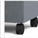
5" Heavy Duty Caster