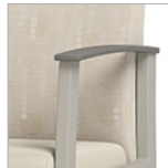
Solid Surface Arm Cap (Standard)