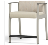
Step for User Comfort and Stability