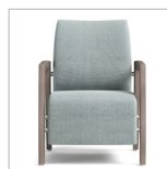
Metal Stand-Off Option