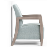
Wall Saver Design