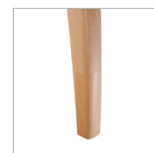
Perma-Coat Wood Leg Protector