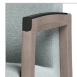
Urethane Arm Cap