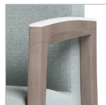
Solid Surface Arm Cap (Standard)