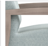
Unique one-piece Seat/Back with Cove Wipe-Out Design