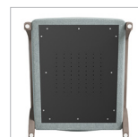
Secure Bottom Covers