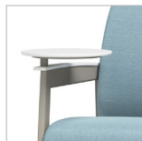
300 lb Capacity Tablet