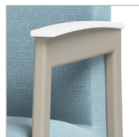
Solid Surface Arm Cap (Standard)