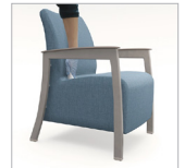
Unique one-piece Seat/Back with Cove Wipe-Out Design