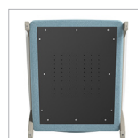
Secure Bottom Covers