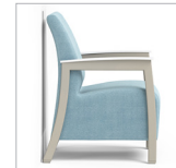
Wall Saver Design