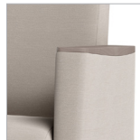
Wood Arm Cap