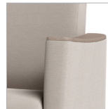
Solid Surface Arm Cap