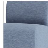
Unique one-piece Seat/Back with Cove Wipe-Out Design