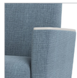
Solid Surface Arm Cap