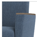
Wood Arm Cap