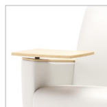
300 lb Capacity Tablet