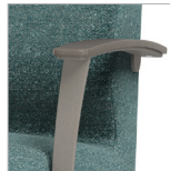
Metal Arm with Solid Surface Arm Cap