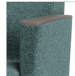
Upholstered Arm with Solid Surface Arm Cap