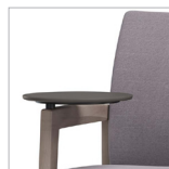
300 lb Capacity Tablet