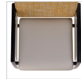
All Sides Clean-Out (Island Seat) Option