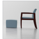
Low Tide Footstool with Low Tide Chair