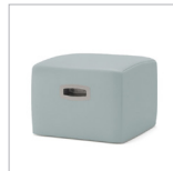
Recessed Pull Handle