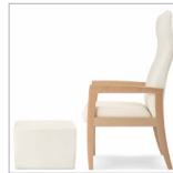
Tide Patient Chair with Footstool Out