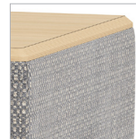
Laminate or Veneer/ Plywood Edge Top