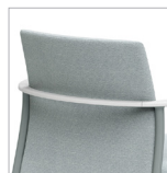
Solid Surface Integrated Handle