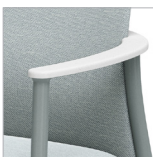
Solid Surface Arm Cap (Standard)