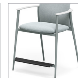
Step for User Comfort and Stability