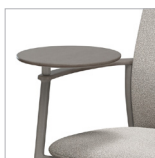
300 lb Capacity Tablet