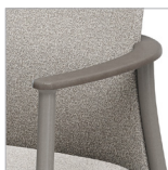
Solid Surface Arm Cap (Standard)