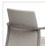
Solid Surface Integrated Handle