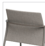
Solid Surface Integrated Handle