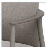
Solid Surface Arm Cap (Standard)