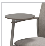
300 lb Capacity Tablet