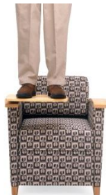
Extremely Strong Construction with Lifetime Warranty