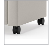
Heavy Duty Caster