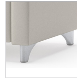
Aluminum Nave Leg