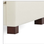
Square Wood Leg