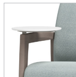
300 lb Capacity Tablet