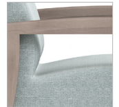
Unique one-piece Seat/Back with Cove Wipe-Out Design