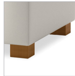
3"H Wood Leg