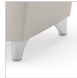
Aluminum Nave Leg