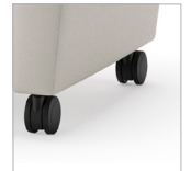
Heavy Duty Caster