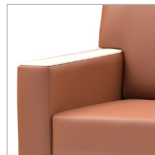
Solid Surface Arm Cap