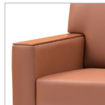
Wood Arm Cap